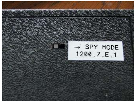
Figure 2. Switch for "SPY" mode (shown in “normal” position).